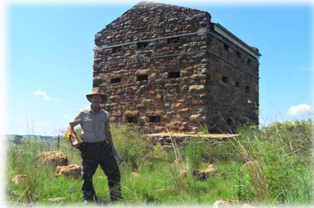
Boer War Blockhouse

I then started learning the history of South Africa, and found myself loving all the stories that were told about the 2 nd Boer war (11 th Oct, 1899 – 31 st May, 1902) I then decided that these were the sites that I wanted to detect, and to try and bring life through the relics that were found.