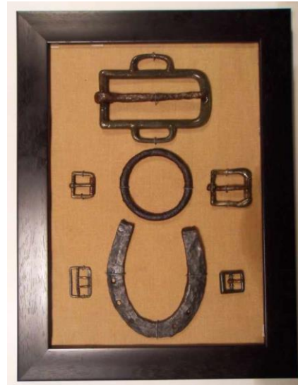
Finds from a Horse Gear Store