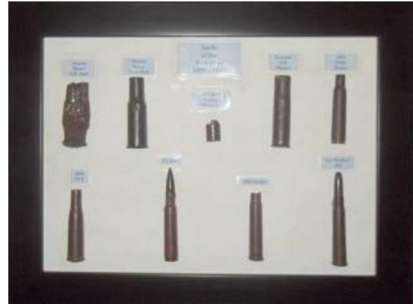
Bullet Cases of the Boer War

South Africa is rich in history and in culture. We are living in an exciting place, at an exciting time, with great weather for metal detecting, which we can do for most of the year, only being hampered by the long grass in the winter months. The winter months are the time when research takes place, and new sites are found for the following detecting season.